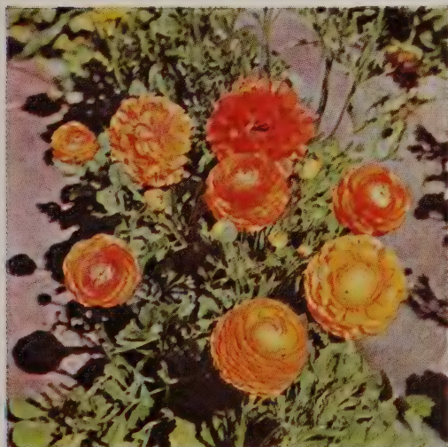
OUR PRIZE ORANGE SHADES OF RANUNCULUS

Large semi-double flowers of the most brilliant and delicate shades and colors, including a good proportion of rose, pink, lavender and blues. (See page 3 for prices and sizes.)